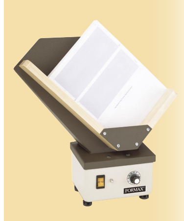
A 400 Series Jogger is a recommended option that reduces static electricity from forms and aligns them for proper feeding

U.S. Patents 7,063,656 & 7,066,871 Other Patents Pending