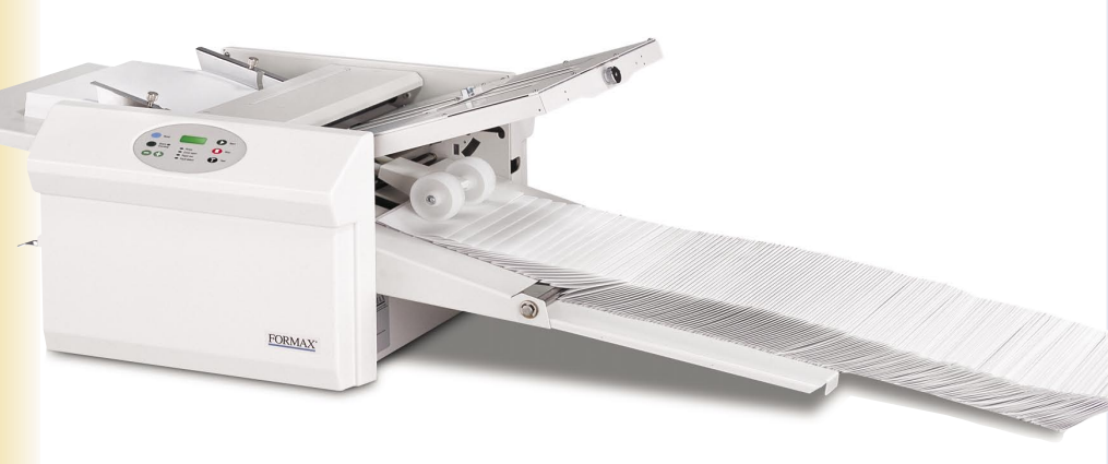
Shown with fully extended Telescoping Outfeed Stacker

The FD 340 Document Folder is a fast, dependable and easy-to-use solution for virtually all folding applications. Six popular folds are clearly marked on the fold plates for quick set-up and operation. Adjustments can also be made to process a variety of custom folds.