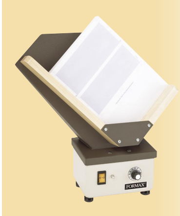
A 400 Series Jogger is a recommended option that reduces static electricity from forms and aligns them for proper feeding

Pressure Sealers • Inserters • Document Folders • Shredders • Joggers • Industrial Bursters • Tabletop Bursters/Cutters • Signers • Letter Openers • Decollators