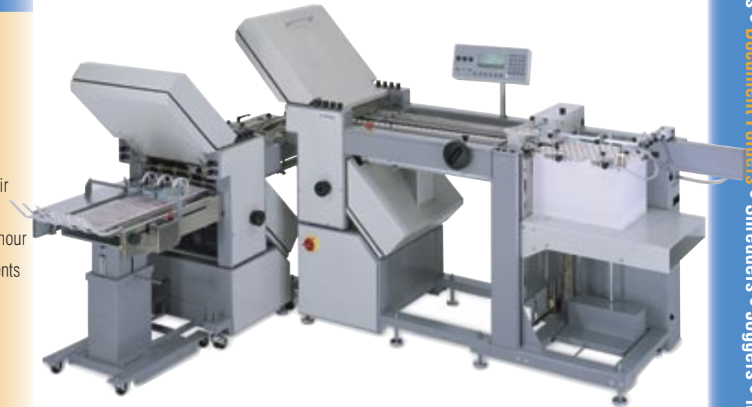
FD 3950-PF in line with FD 3950-R

Phone: (818) 997-8061 Fax (818) 786-9165