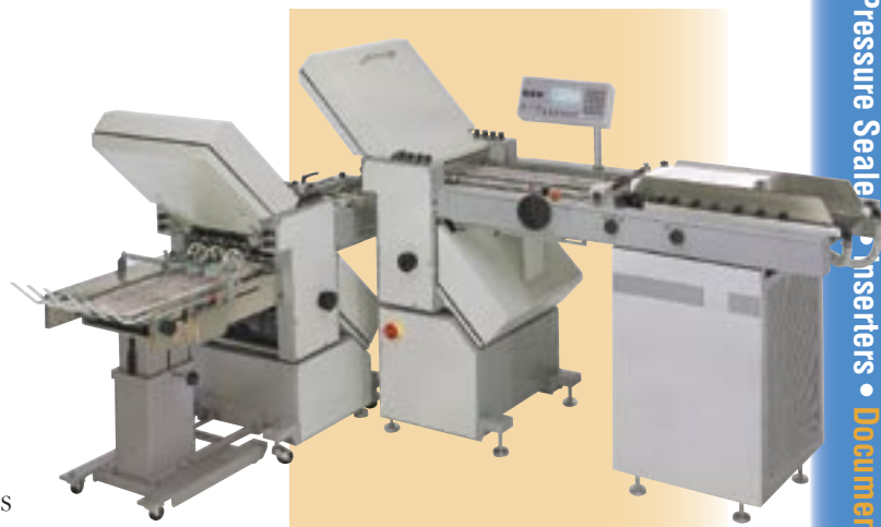
FD 3950 in line with FD 3950-R

* Three-phase power is required, as well as a customer-supplied automated pallet jack or fork lift for installation.